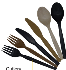
Cutlery & utensils